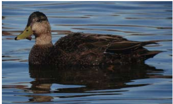
American Black Duck: Ken Rosenberg

Identify and consult stakeholders – Defining the problem will help identify stakeholders who need to be engaged in assessing its scope, setting a conservation goal, and eventually pursuing that goal with tools built from monitoring data. Biologists who design and implement monitoring programs are rarely in the position to dictate management or conservation strategy. Terms are more often set by policy makers, regulatory agencies, managers on the ground, and land protection specialists, based on information provided by biologists. Ask the following