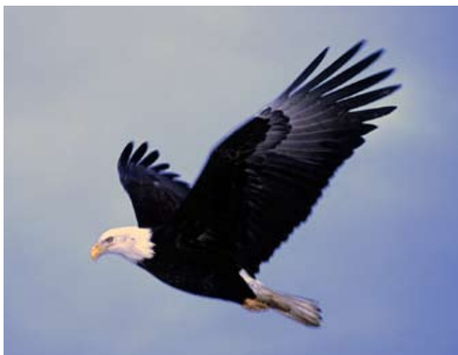
Bald Eagle: Ralph Wright

Assess the cost-effectiveness of the chosen management and monitoring strategies – It is also important to ensure that resources are allocated efficiently so that desired information is obtained without unnecessary cost. Because data are expensive to collect, results should only be as precise as necessary to achieve the monitoring and conservation objectives. Field et al. (2004) argued that