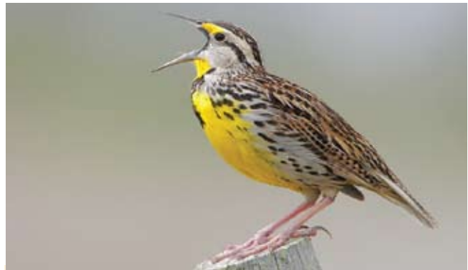
Eastern Meadowlark

Effectiveness monitoring, also known as evaluation, consists of monitoring populations before and after conservation decisions are implemented. This is a critical