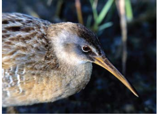
Clapper Rail: Ralph Wright

Identify appropriate analytical procedures – A variety of analysis methods can be used to estimate variables such as productivity, density, and occupancy (the proportion of an area occupied or the probability that an area is occupied by the species of interest). Likewise, numerous methods exist to model habitat and estimate trends. Thomas (1996), Nur et al. (1999), and Vesely et al. (2006) provide overviews of many standard analytical procedures, while selected references and useful links can be found online at http://www.nebirdmonitor.org . Consulting with a statistician or biometrician when selecting the appropriate analytical methods is always recommended.