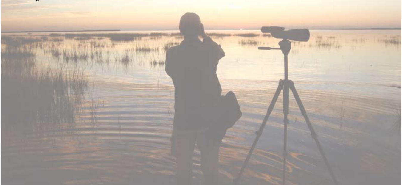
Marsh bird monitoring: © Bryan Pfeiffer

way, the opportunities they represent will have been squandered. Recognizing these assets and aligning them behind clear and unified goals will be critical to successful bird conservation in the Northeast. Success also depends on garnering the support of agency administrators and other decision makers. A carefully planned, cooperative approach worked for Peregrine Falcons and can work for other species at risk today. Attention to the details summarized in this handbook should help improve the effectiveness of bird monitoring programs in the region. Maintaining the Northeast's rich natural heritage depends, in part, on building a legacy of coordinated bird monitoring that provides crucial information to conservation planning, implementation, and decision making processes.