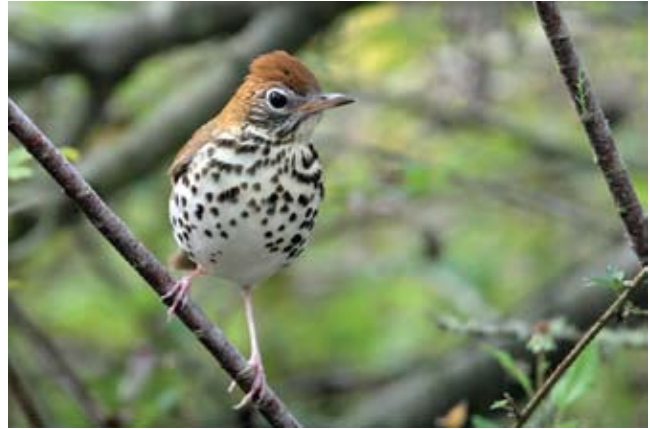
Wood Thrush: Greg Lavaty

Build on monitoring assets that are fundamentally sound – Exercise caution in selecting an existing program or protocol because deficiencies in design and implementation are widespread. To assess the suitability of available survey options, use the online monitoring evaluation tool developed by Southeast Partners In Flight ( http://www.sepif.org ). This interactive tool describes appropriate uses of survey data based on user responses to a comprehensive set of questions. It also provides a list of potential biases and scores for regional coordination, management relevance, and data security.