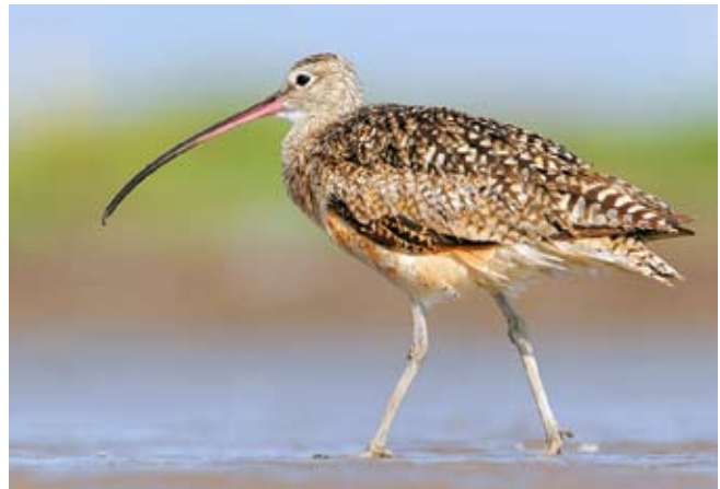
Long-billed Curlew: Greg Lavaty

Despite numerous conservation success stories, northeastern birds still face threats of increasing magnitude and complexity. Rapid development, invasive species, climate change, and a host of other issues have placed many of the Northeast's varied habitats and associated birds at risk. However, the collective capacity to monitor and react to threats also has grown. Today, the region is home to more conservation organizations, more bird monitoring programs, and more skilled observers than ever before. In recent years, they have accumulated vast stores of data that can help establish population targets and strengthen survey designs. Similarly, methods to collect, analyze, and exchange monitoring information have advanced considerably. However, if these improved monitoring resources are not used in the most efficient