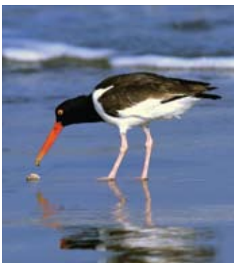
American Oystercatcher