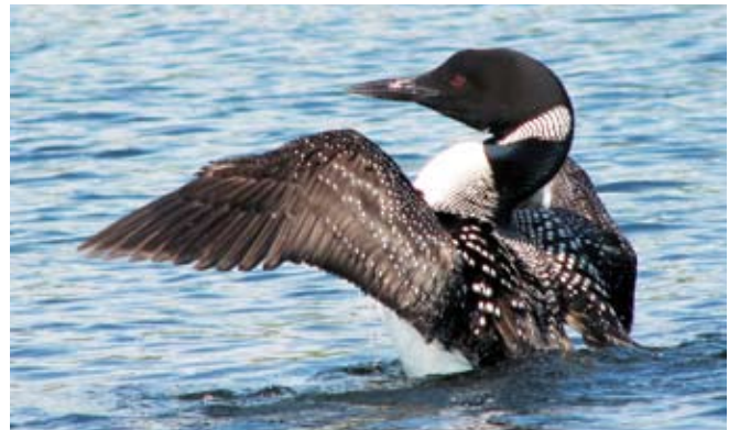
Common Loon