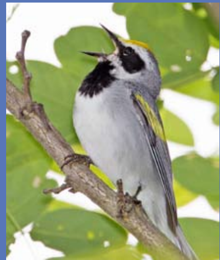
Golden-winged Warbler