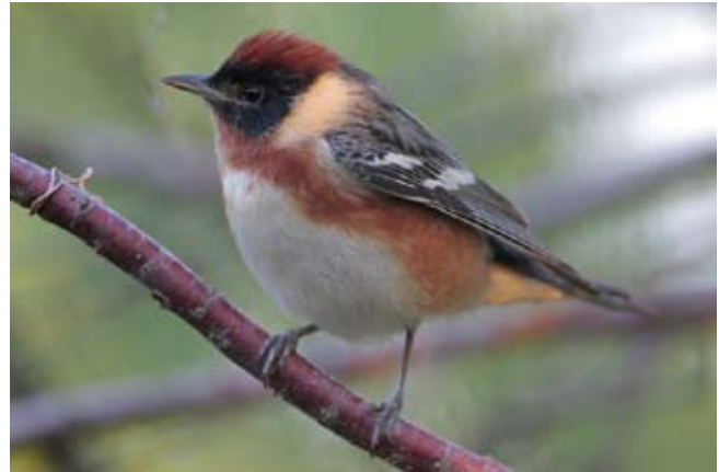
Bay-breasted Warbler: Greg Lavaty

Evaluate the conceptual model – Go back to the conceptual model(s) and assumptions from Step 4 and evaluate their performance in the face of real-world data. Do the monitoring results confirm the model and its assumptions, or support any of the hypothesized relationships? If a management action was taken, did it achieve the expected results? If not, there are several possible explanations: the assumptions were wrong, the management action was poorly chosen or poorly executed, the conditions at the project site have changed, information from monitoring was faulty, or these problems occurred in