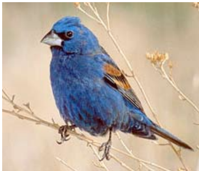
Blue Grosbeak: Peter LaTourrette, www.birdphotography.com

Monitoring programs that build and test alternative models are better equipped to distinguish the importance of individual conservation activities. In such cases, it can be useful to assign measures of confidence to each alternative. For example, three models could be weighted 0.5, 0.25, and 0.25, respectively, if the first model seemed twice as likely as the other two to reflect real dynamics. These “model-specific probabilities” can be adjusted as monitoring results come to support one hypothesis over another (Nichols and Williams 2006) and can then be