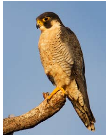
Peregrine Falcon: Peter LaTourrette, www.birdphotography.com