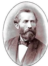
Anton de Bary (1831-1888)