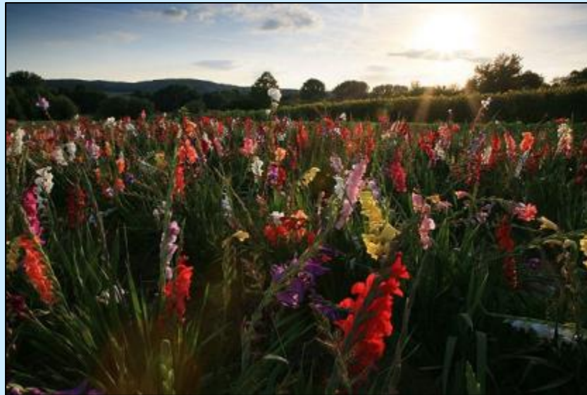
Gladiolus farm - what we expected