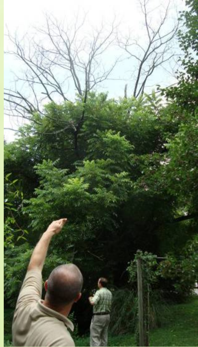
Profusion of eppicormic shoots