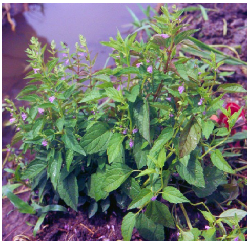
Skullcap on a cooperating grower's farm, 2004

A few cooperating growers in the mountain region are growing Skullcap ( Scutellaria lateriflora ) this season. This could be a promising perennial herb for North Carolina